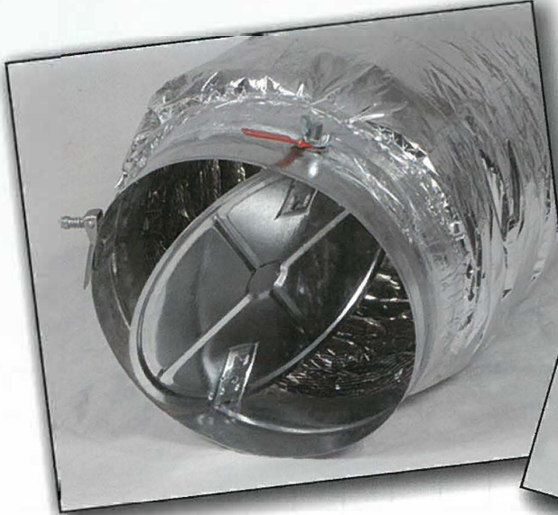
MODEL L-181M w/ CC/CC AND DAMPER