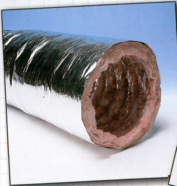
Model # 2PMJ