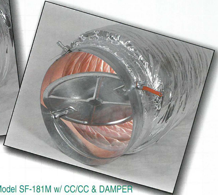
Model SF-181M w/ CC/CC & DAMPER

DESCRIPTION - CASCO Model SF-181M is a fully insulated, Class 1, U.L. listed Air Duct. This versatile product is designed for low pressure commercial, industrial and residential applications where sound attenuation is important. Complete acoustical test report available upon request (ADC Test Code FD 72-R1).